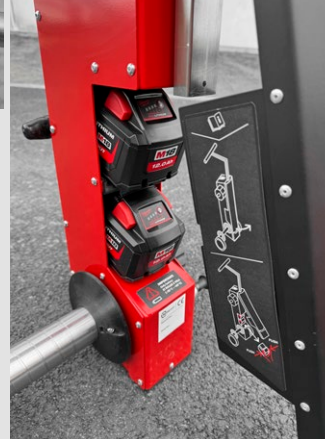
Electric motor powered by M18 batteries

Hose protector protects the fire hose and coupling against fraying during winding