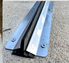
Stainless steel profiles perfectly seal the defined space against underflow