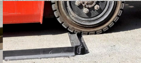
The material is resistant to being driven over by vehicles