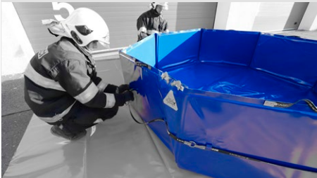
Installation of perimeter belt