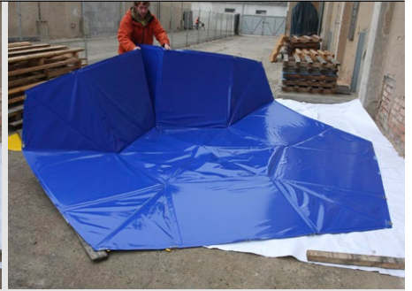
The whole tank can be set up by a single person in minutes