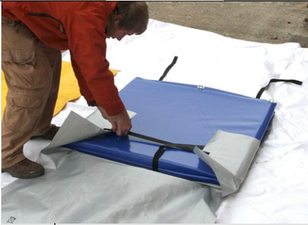
The tank can be packaged to surprisingly small dimensions